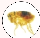
Adult flea (x5) ( Ctenocephalides sp. )

Fur mites are much smaller than fleas and are just visible to the naked eye. Sometimes