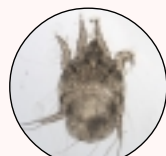
Ear mite (x40) ( Otodectes cynotis )