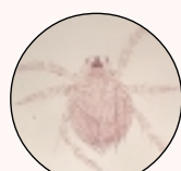
Harvest mite (x40) ( Trombicula autumnalis )

called 'creeping dandruff', they affect dogs, cats and rabbits. The mites cause variable degrees of itching and may also bite the owners of affected pets.