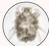
Fur mite (x30) ( Cheyletiella sp. )